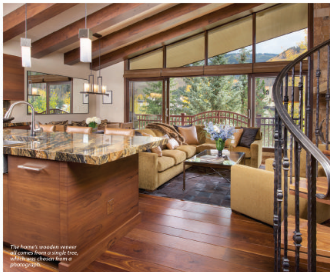
The home's wooden veneer all comes from a single tree, which was chosen from a photograph.

The natural light penetrates the inner spaces, creating the added benefit of cooling down the rooms in the summertime, and increasing general air circulation.