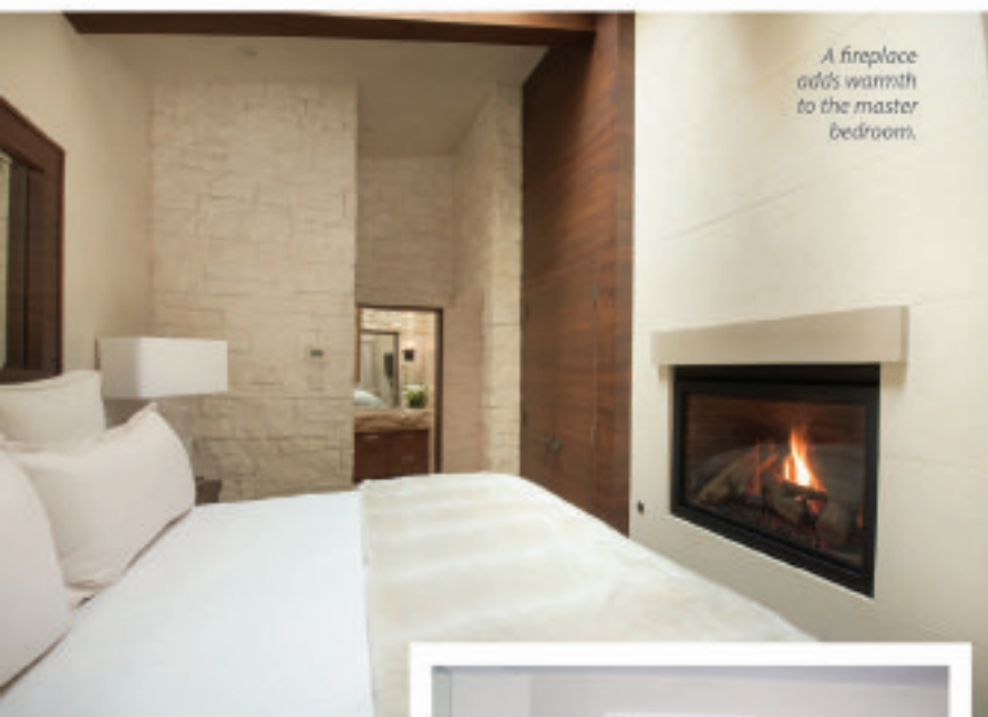
A fireplace adds warmth to the master bedroom.