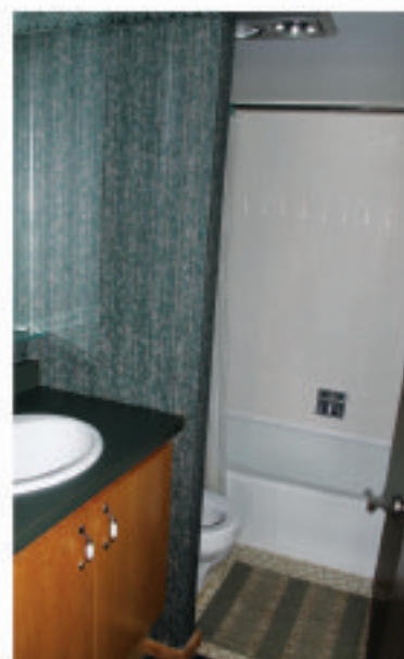
The custom sandstone trough sink in the master bath came from The Gallegos Corporation's quarry.