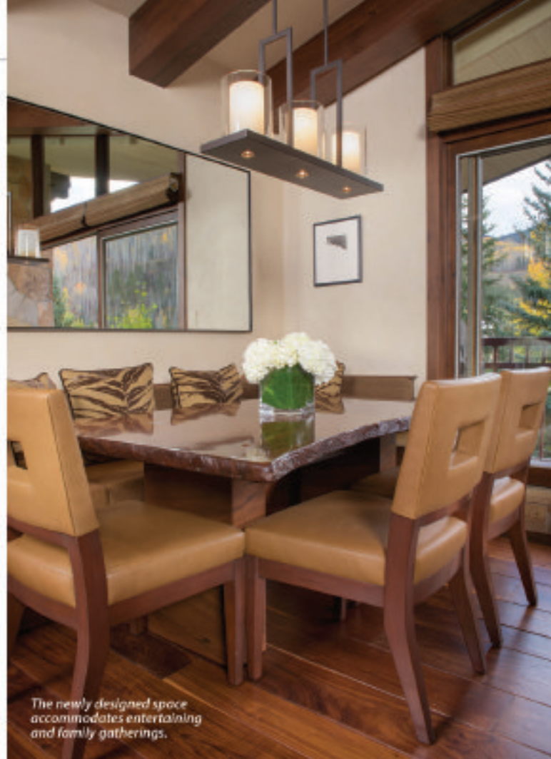
The newly designed space accommodates entertaining and family gatherings.