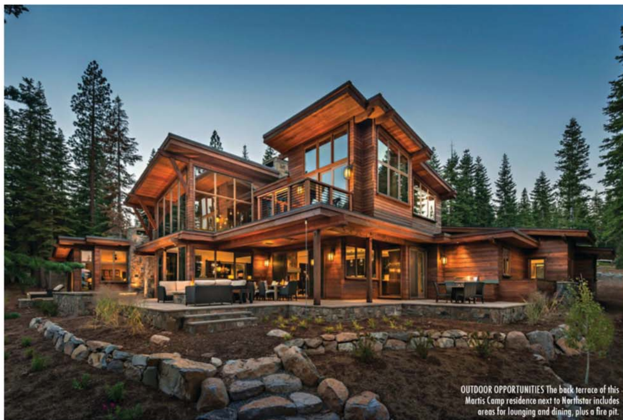
OUTDOOR OPPORTUNITIES The back terrace of this Martis Camp residence next to Northstar includes areas for lounging and dining, plus a fire pit.

diagonal rooflines echo the rising elevation of surrounding mountain peaks. Exterior siding, interior finishes and furnishings in shades of gray and taupe reflect the color of aspen trees in winter. The natural materials used throughout—wire-brushed dark-oak flooring, Calcutta marble countertops and stone streaked with lichen—soften the harder edges. “It’s very organic,” says Jaffa.