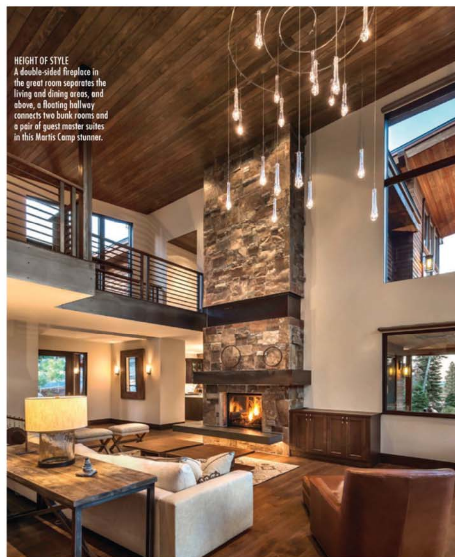
HEIGHT OF STYLE A double-sided fireplace in the great room separates the living and dining areas, and above, a floating hallway connects two bunk rooms and a pair of guest master suites in this Martis Camp stunner.

“WE’VE BEEN HAVING A LOT OF FUN PUSHING THE LIMITS OF WHAT PEOPLE THOUGHT OF AS CONTEMPORARY ARCHITECTURE IN A MOUNTAIN ENVIRONMENT.”