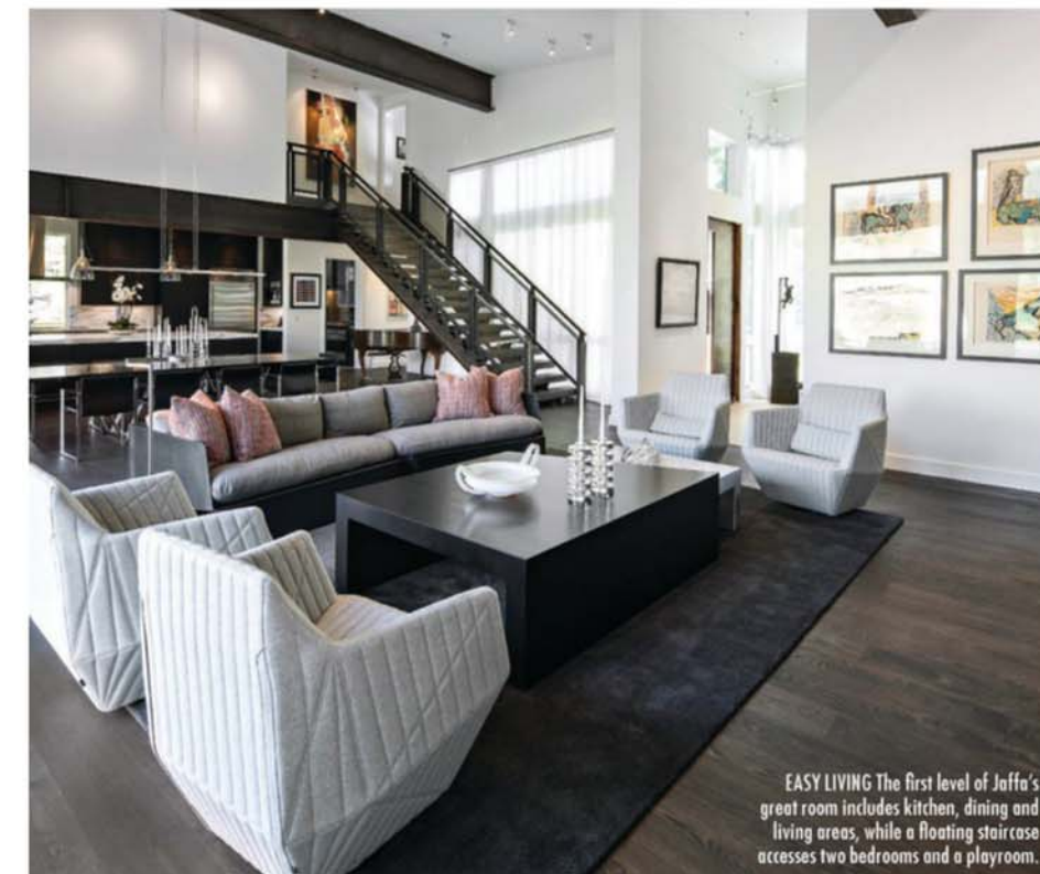
EASY LIVING The first level of Jaffa's great room includes kitchen, dining and living areas, while a floating staircase accesses two bedrooms and a playroom.

The LEED-certified home takes up three levels on the steep, pie-shaped site. To create a sense of continuity, Berglund designed a striking wraparound floating staircase. "It provides a powerful spatial connection between the three stories," he says.