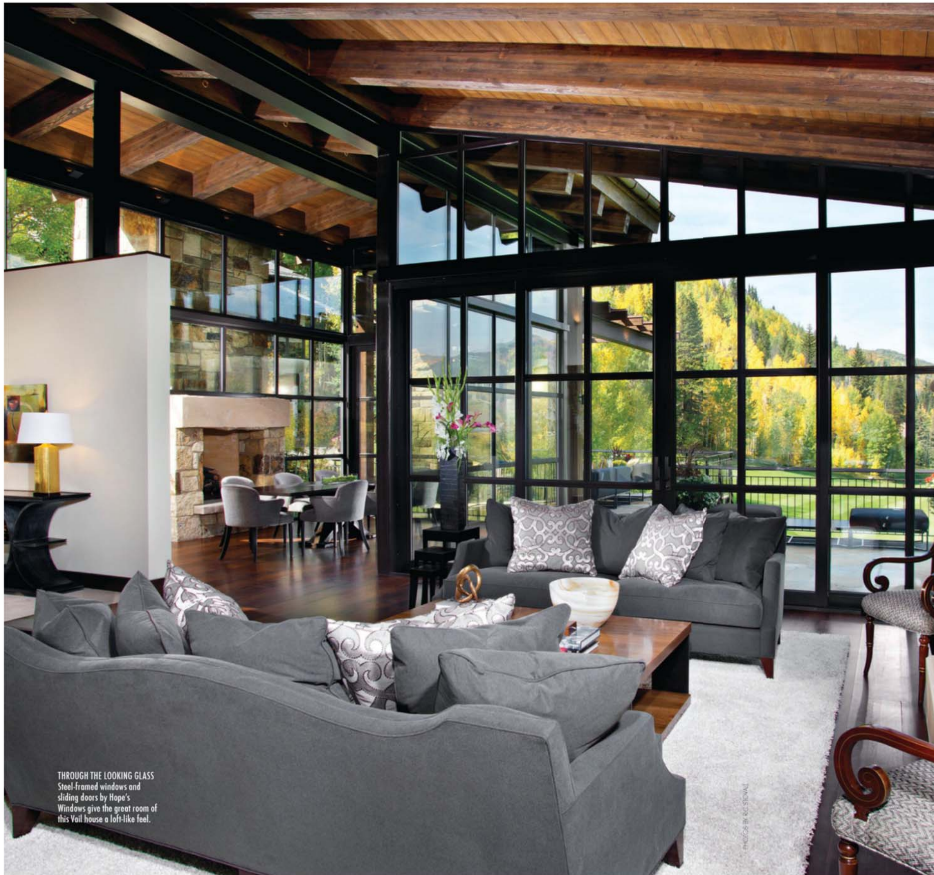
THROUGH THE LOOKING GLASS Steel-framed windows and sliding doors by Hope's Windows give the great room of this Vail house a loft-like feel.