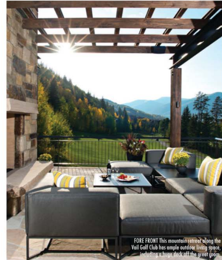
FORE FRONT This mountain retreat along the Vail Golf Club has ample outdoor living space, including a huge deck off the great room.