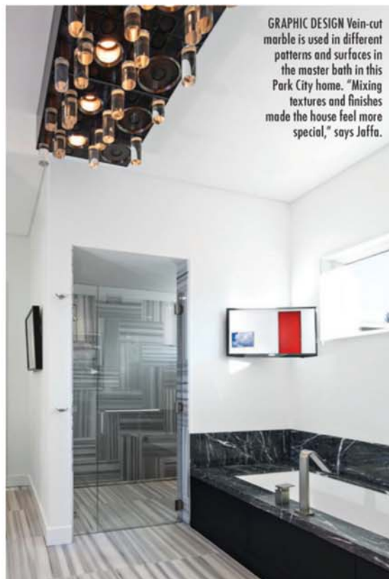
GRAPHIC DESIGN Vain-cut marble is used in different patterns and surfaces in the master bath in this Park City home. "Mixing textures and finishes made the house feel more special," says Jaffa.