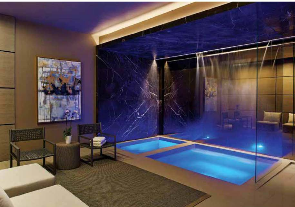
A private spa is but one of the luxurious details that make 165 Forest Road a special house. See story page 76.