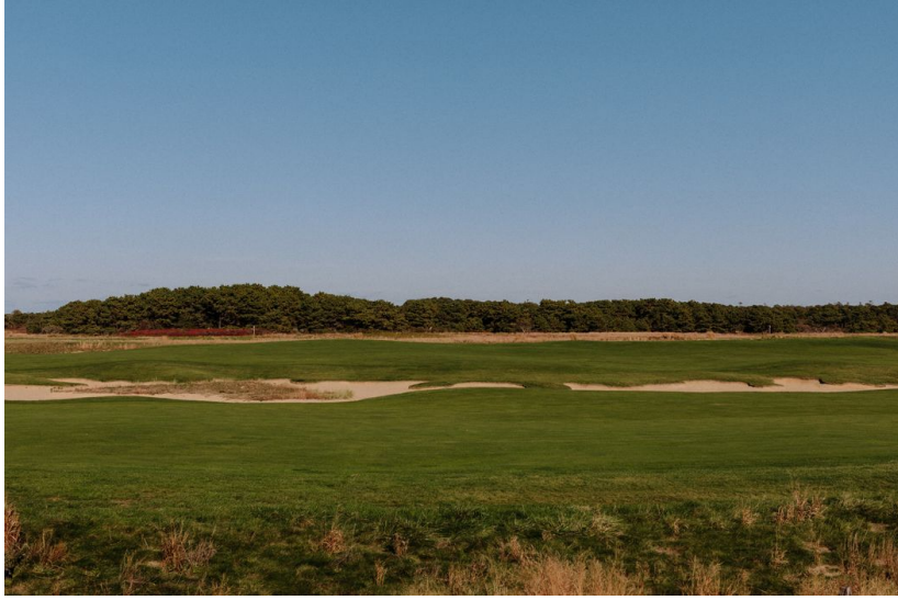
The Miacomet Golf Course on Nantucket is owned by the Nantucket Land Bank, which is charged with aiding conservation, outdoor recreation and agriculture on the island.