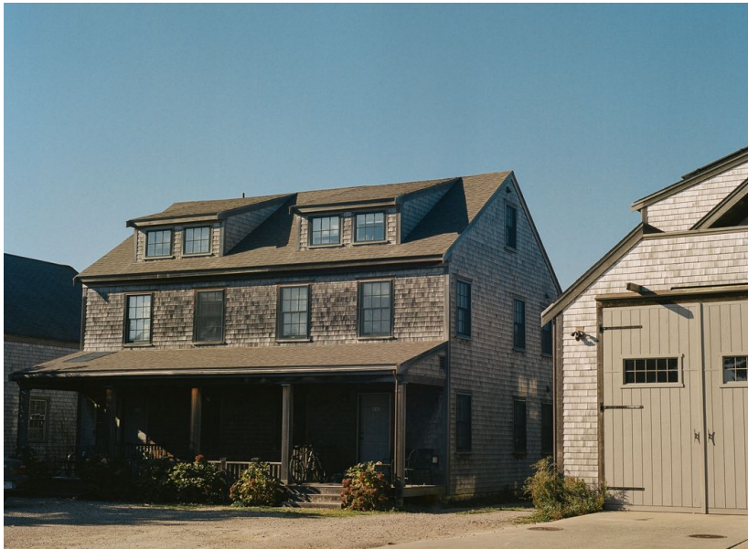
The Nantucket Land Bank spent about $2 million for an eight-bedroom house in which it houses golf course workers.